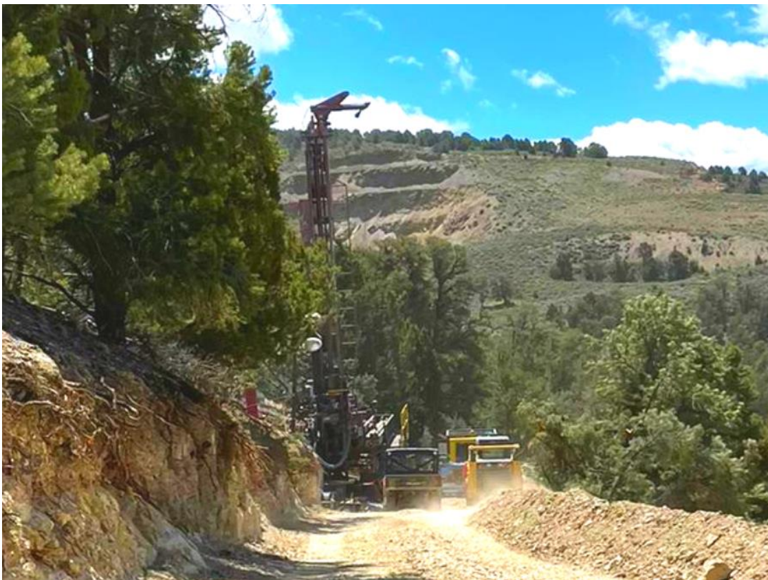
Figure 1: Drilling at the California Zone (Past-Producing Toiyabe-Saddle Open Pit in Background)

Dave Browning, Westward’s VP Exploration, noted: “We’re very happy with the progress of the drilling in these early stages of the campaign. We’re beginning to see improved shift efficiencies at the rig, and expect this trend to continue over the coming days and weeks. Mobilization is now underway to our second target area – Toiyabe Hills North – where earthwork crews have been preparing roads and pads for the past week.”