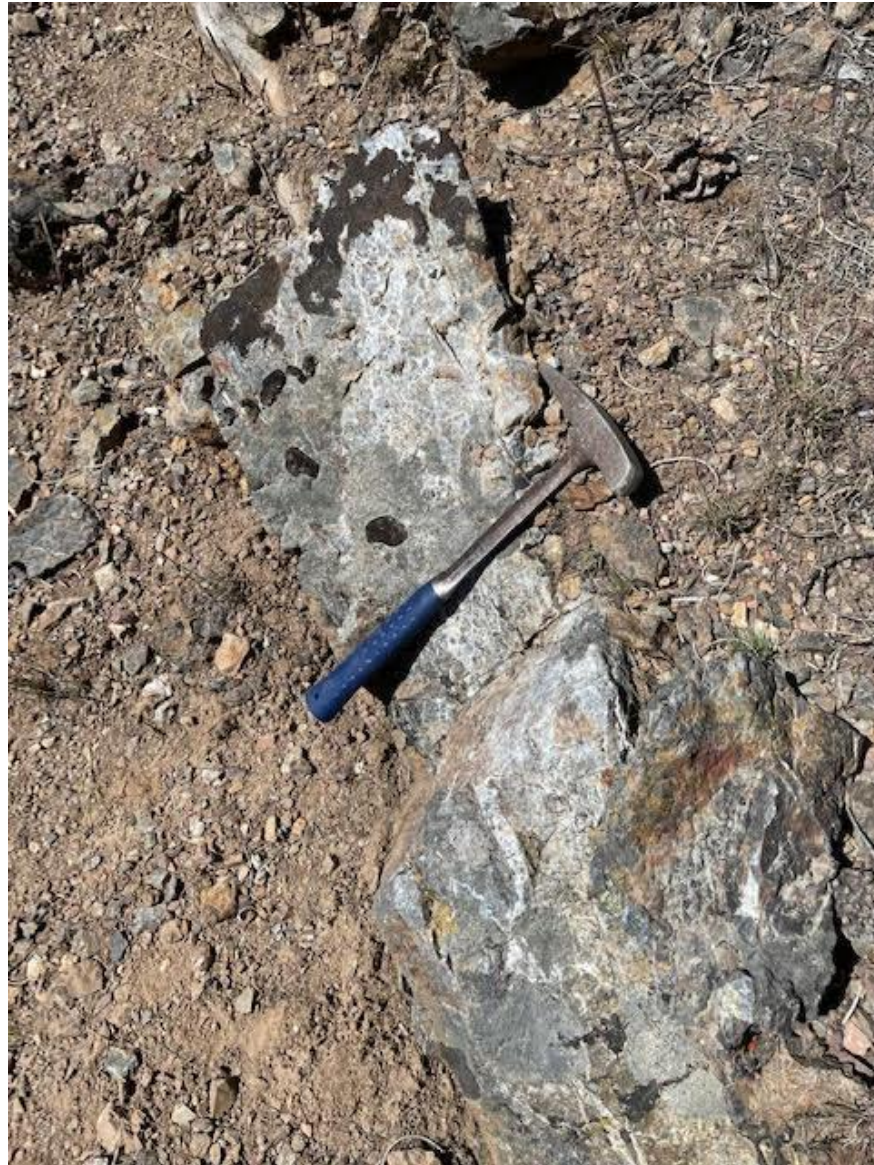
Figure 4: Target Drill Site Cut Exposing a Clay-Altered and Oxidized Igneous Dike within the TH Fault